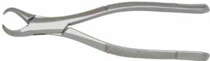
SS203 - Fig.23 Lower molars (Cow-horn beak) $40.00