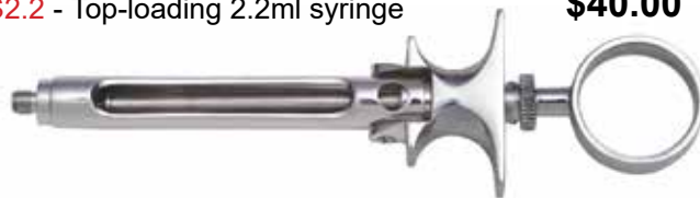
SSS2.2 - Top-loading 2.2ml syringe $40.00