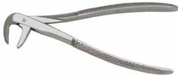
SS163 - Fig.169 Lower canines & premolars $40.00