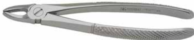
SS176 - Fig.37 Child's upper incisors & canines $40.00