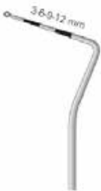
LT7020202 CC Pocket probe SES6