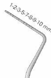
LT7020101 Williams SES6