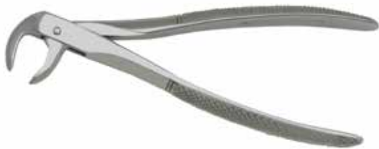
SS161 - Fig.167 Universal lower teeth molars & premolars $40.00