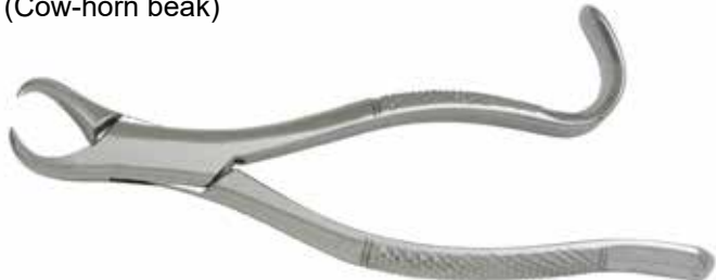
SS199 - Fig.16 Lower molars (Cow-horn beak) $40.00