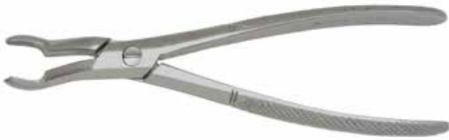
SS137 - Fig.67A Upper Wisdoms