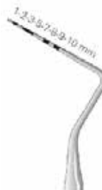
LT7020203 CP10 SES6