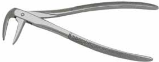
SS164 - Fig.233 Lower roots (Parallel beaks) $40.00