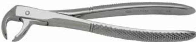
SS172 - Fig.160 Child's upper lower universal (Hawk bill) $40.00