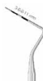
LT7020204 CP11 SES6